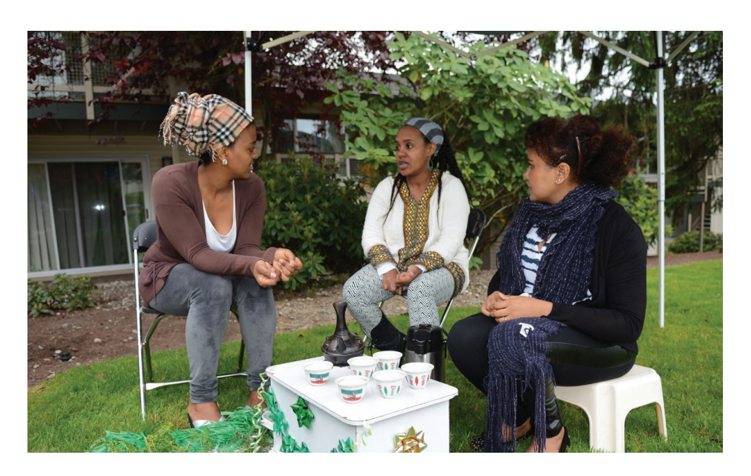
Residents attend a health fair sponsored by Bringing Health Home at the Windsor Heights apartments in SeaTac last May.