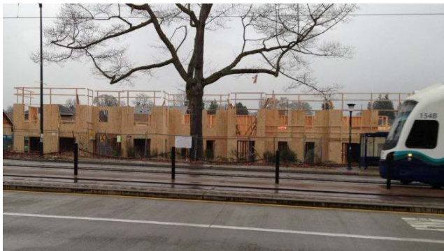
Columbia City Station Apartments: 52 units of new, affordable workforce housing with a “live/ work/ play” design, located at a transit and pedestrian oriented site.

To be eligible, at least 51% of the units in a participating project must be occupied by low-income families. Once the debt is paid off, the rents are adjusted to cover expenses so the maximum number of low-income persons can be served in the project. The Washington Works program invested the $25 million in ten projects located in seven communities throughout the state. These ten projects provide 460 units of workforce housing in rural, urban and suburban communities. The Washington Works investment leveraged a private investment of just over $4.42 million through the sale of tax-exempt bonds to private investors.