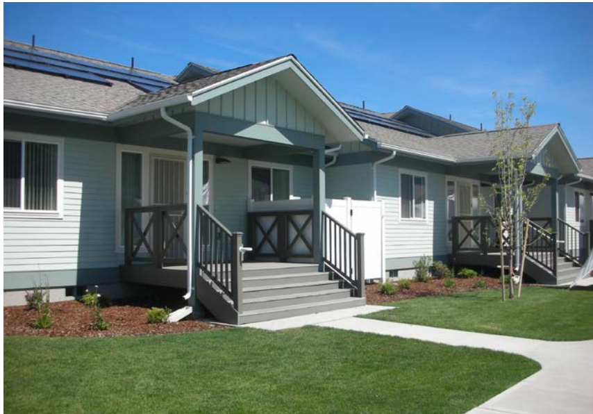
East Oroville Harvest Park: 10 units of seasonally occupied farmworker housing in Oroville, Wash., can accommodate up to 76 people.

On-going appropriations to the Housing Trust Fund are essential if the state is to continue making progress in housing its workforce due to the lack of local funds in rural communities, low incomes of farm workers and global competition for agriculture. State funds are also critical to leveraging federal funds and private investment. Many local jurisdictions do not have adequate provisions in either city or county zoning to support affordable housing, including farmworkers, as required by the Growth Management Act.