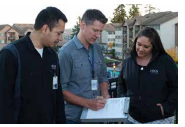
WSHFC team inspecting Creston Point Apartments in South Seattle, built with the help of financing from the Commission. Managed by HNN Associates.

Our staff supports property owners and managers every day with technical assistance, training, and on-site visits.