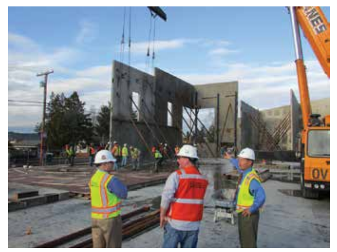
Gordon Family YMCA

BELLINGHAM: Whatcom Community College Foundation $7.8 million to acquire a new Health Professions Education Center and refund earlier bonds.